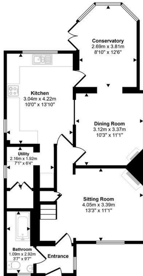
Ground Floor Approx 66 sq m / 708 sq ft

Approx Gross Internal Area 109 sq m / 1175 sq ft